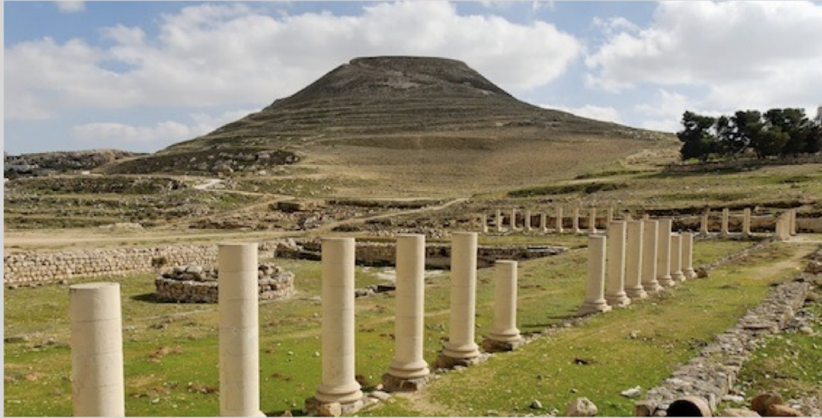
Option #1 - Herodium