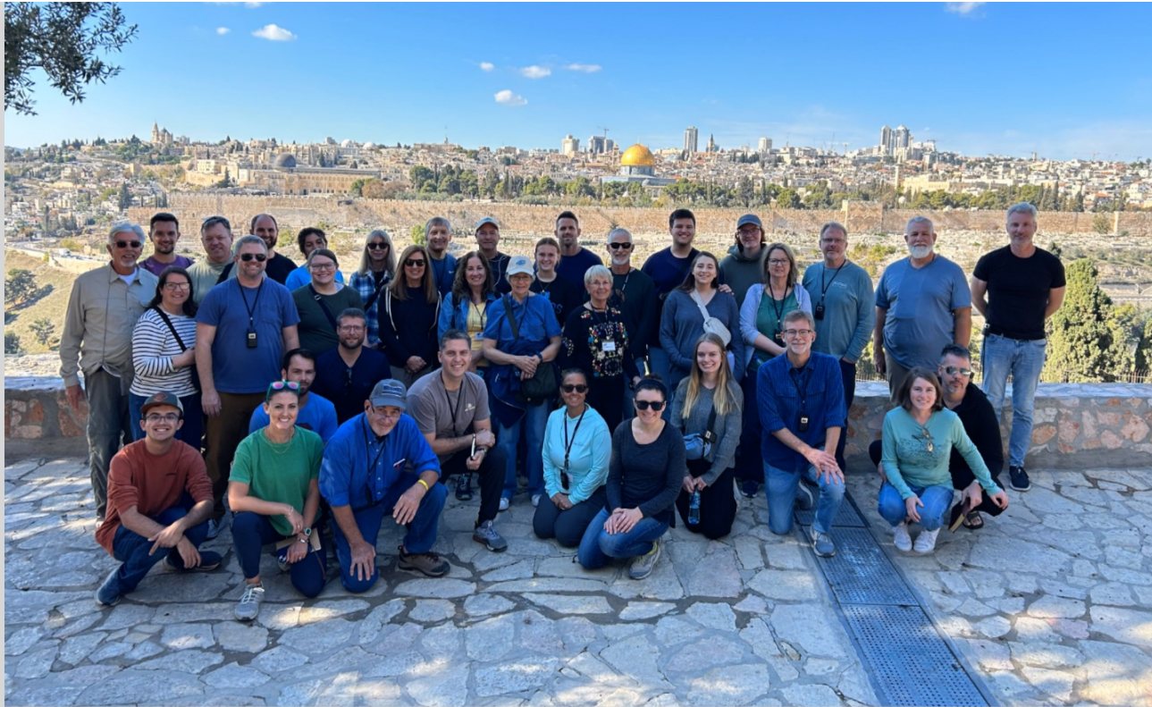
Option #3 - Temple Mount