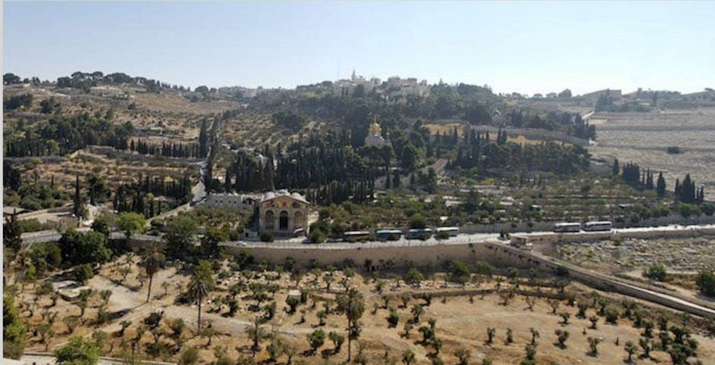
Option #2 - Mount of Olives