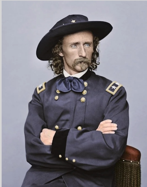
Colonel George Armstrong Custer