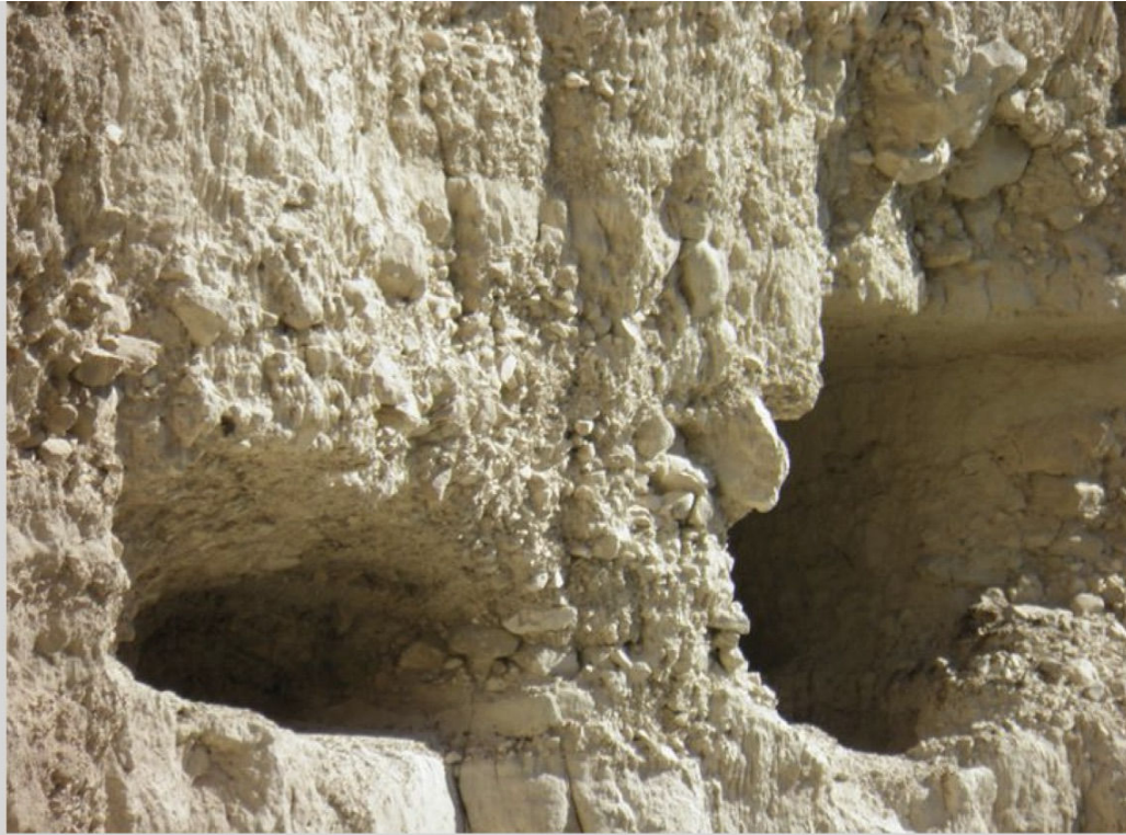
Caves of Engedi