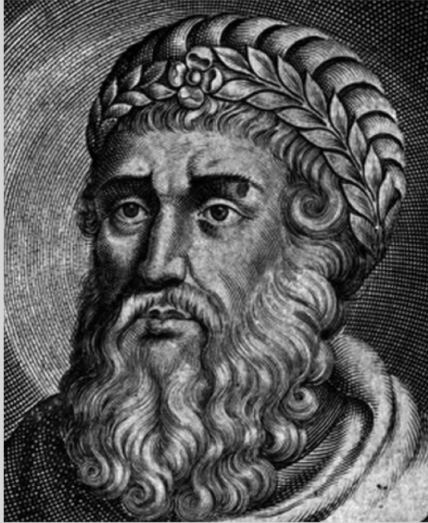
Herod the Great