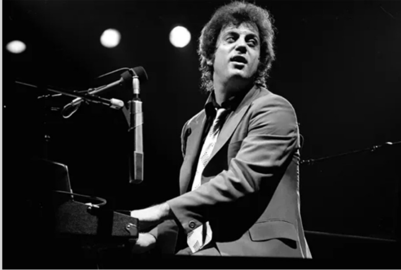
Billy Joel 1977 “Only the Good Die Young”