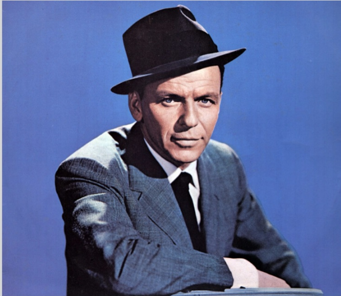
Frank Sinatra 1969 “I Did It My Way”