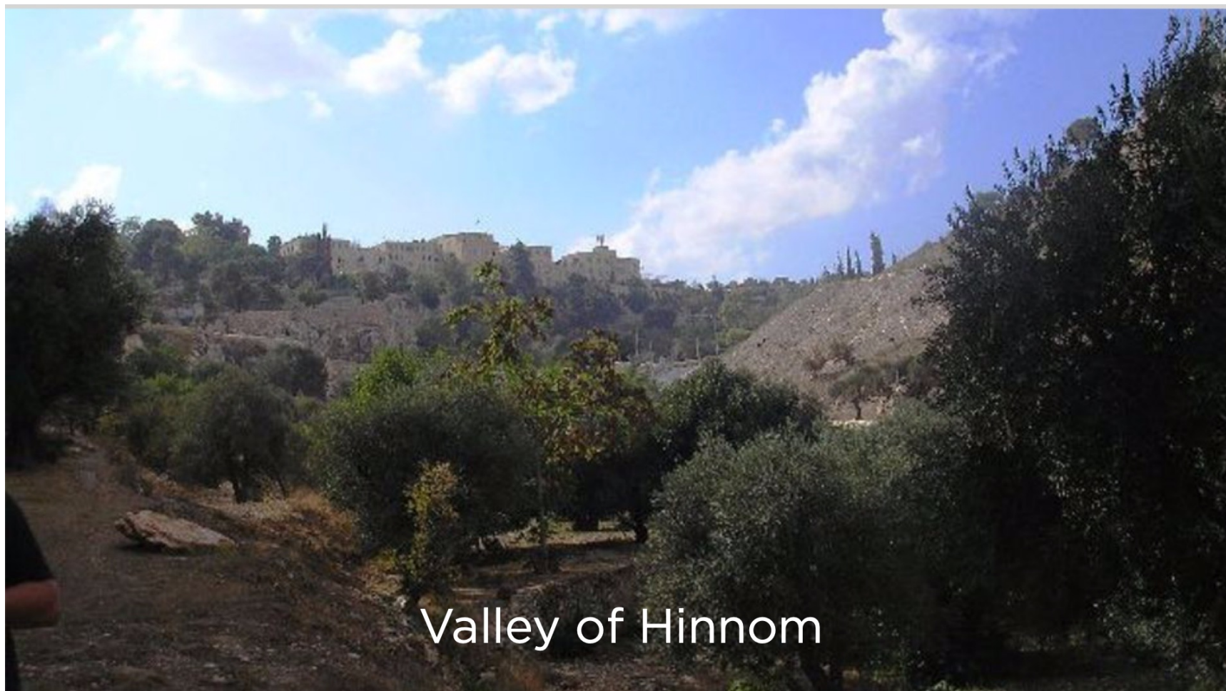
Valley of Hinnom