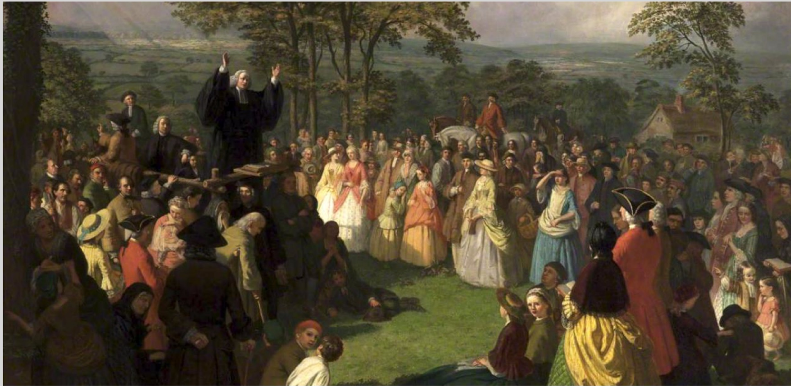
The Great Awakening