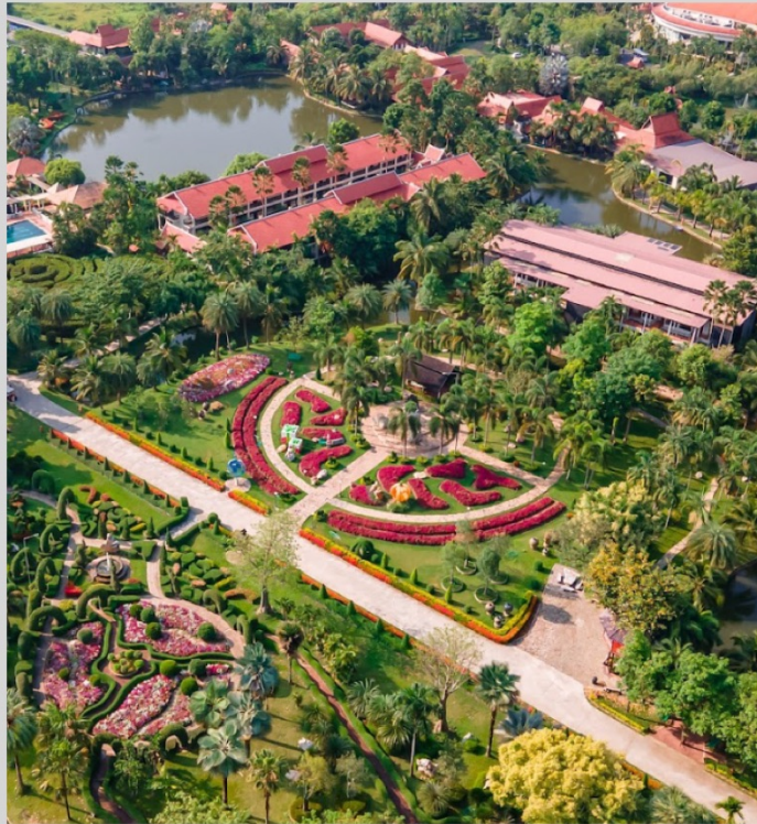
Thailand Retreat - Frontline Missions