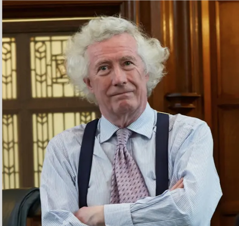
Lord Jonathan Sumption