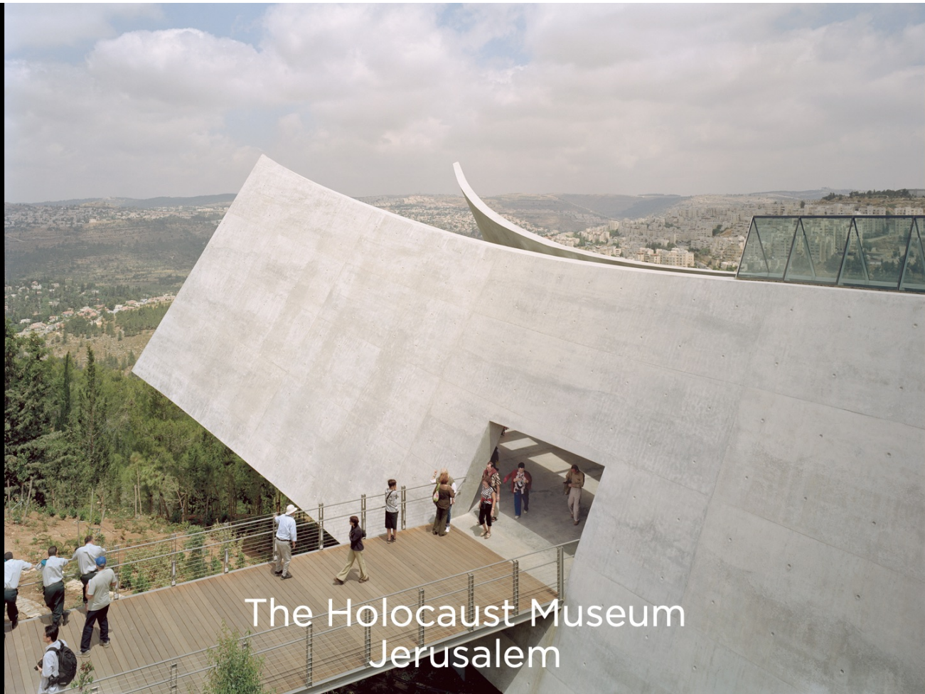
The Holocaust Museum Jerusalem