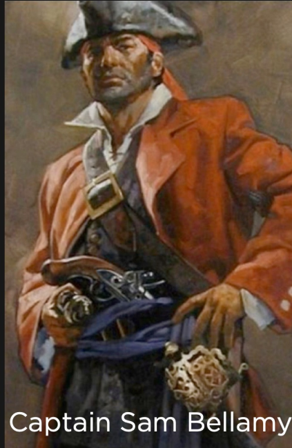
Captain Sam Bellamy